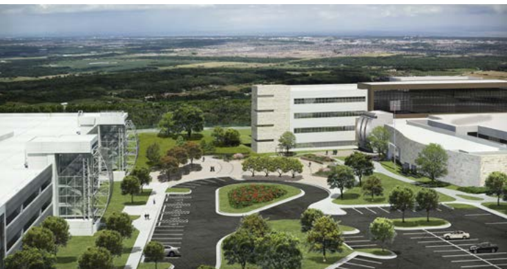
Secured Administration Operation Facility, Fort Belvoir, VA