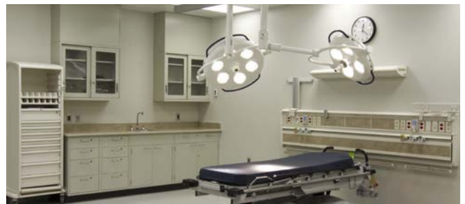
Evans Army Community Hospital Alteration & Expansion, Ft. Carson, CO