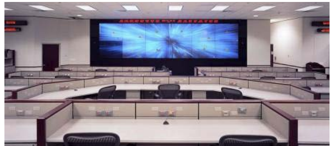
Pacific Command HQ, Camp H.M. Smith, HI