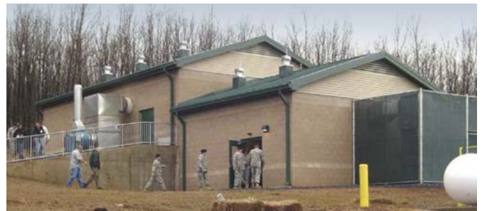
Live Fire Shoot House, Fort Indiantown Gap, PAARNG