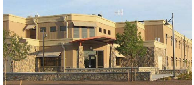
33 Unaccompanied Enlisted Personnel Housing Complexes, Fort Bliss, TX