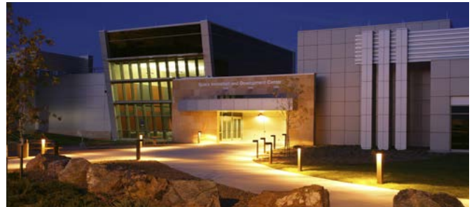
Space Innovation and Development Center, Schriever AFB, CO